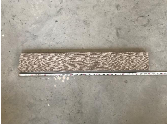
Front View(Test Face)