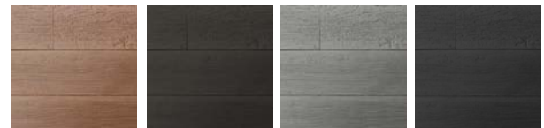
Cedar Dark Oak Grey Stone Midnight

This stunning range captures natural variances and indentations of driftwood to provide a timeless look.