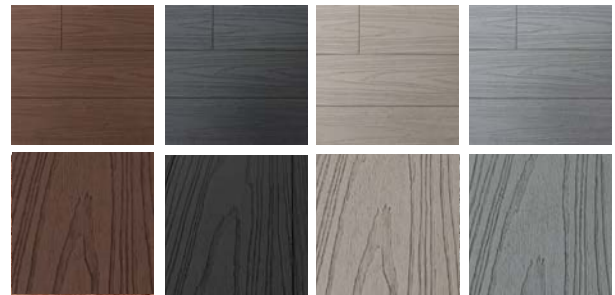
Merbau 2.0 Cape Grey Limewash 2.0 Silver Ash

A sleek double-sided collection blending designer aesthetics with the strongest composite technology on the market.