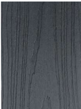
CAPE GREY Wood Grain Finish