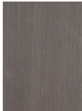
GREY GUM Heavy Brush Finish