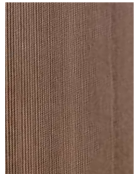
CEDAR WOOD Heavy Brush Finish